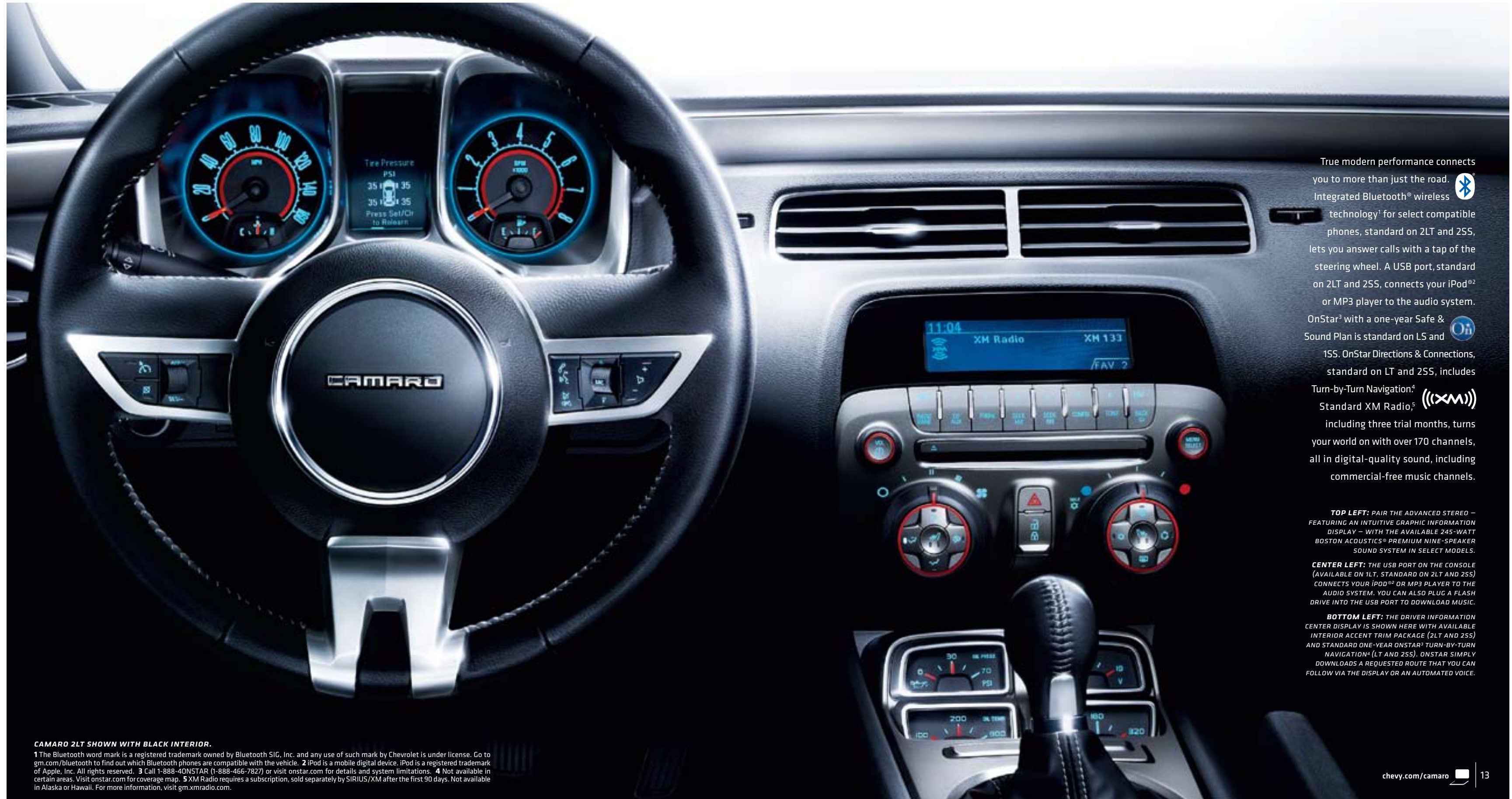
CAMARO 2LT SHOWN WITH BLACK INTERIOR.

1 The Bluetooth word mark is a registered trademark owned by Bluetooth SIG, Inc. and any use of such mark by Chevrolet is under license. Go to gm.com/bluetooth to find out which Bluetooth phones are compatible with the vehicle. 2 iPod is a mobile digital device. iPod is a registered trademark of Apple, Inc. All rights reserved. 3 Call 1-888-4ONSTAR (1-888-466-7827) or visit onstar.com for details and system limitations. 4 Not available in certain areas. Visit onstar.com for coverage map. 5 XM Radio requires a subscription, sold separately by SIRIUS/XM after the first 90 days. Not available in Alaska or Hawaii. For more information, visit gm.xradio.com .