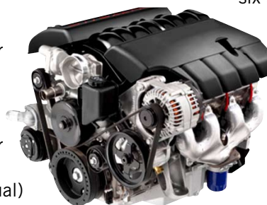
6.2L V8 Engine